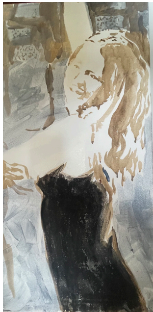
There's a Storm brewing acrylic on canvas 30x40cm