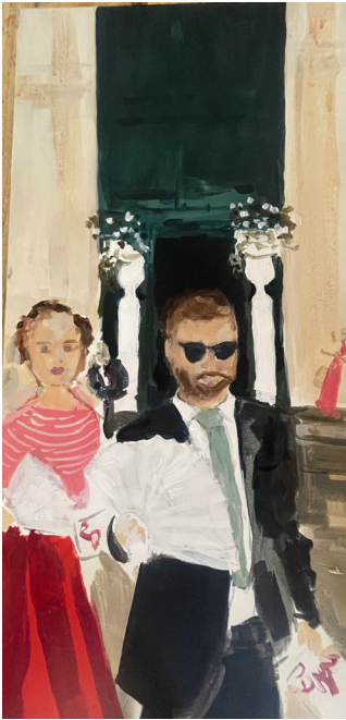
A Formal Event acrylic on canvas 30.5x30.5cm A hot day