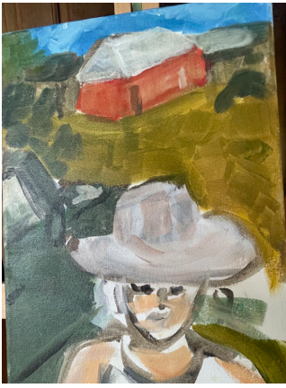
Colonial Building and Land rover acrylic on canvas 30x60cm