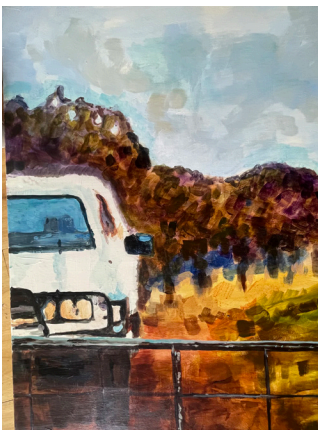
Toyota Hilux LXN107 acrylic on canvas 61x81cm

Visiting a colonial estate from the 1830's in the Southern Midlands of Tasmania I encountered a moment where time lines crossed: the lush landscape with brpad vistas' the new landrover based on the older models, the coloidal building unused, there seemed to be an intensity about it all as if time was buzzing there. Pared down shapes depict the intensity of the moment giving it a type of mathematical reality.