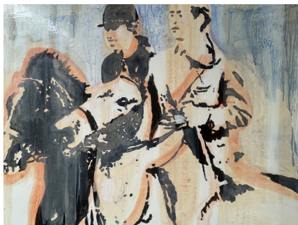
Canter , acrylic on canvas 81x61cm

This collection re imagines the cowgirl archetype as more than a person—it is a way of being or a state of mind. These loosely painted pieces depict the duality of strength and vulnerability, rebellion and grace. Featuring local, popular culture and historical characters the exhibition plays with this sense of identity in its various forms.