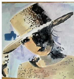
Lunch Break acrylic on canvas 30.5x30.5cm