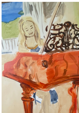
Coconut fire, Cape Tribulation acrylic on canvas 30x40.5 Music with water view (in style of Matisse) acrylic on canvas 61x82cm