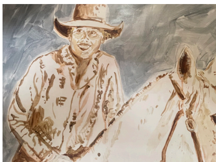
She Got a Cold Heart she got a Warm Smile acrylic on canvas 81x61cm

In 1969 Fairfax media photographed the then Prince Charles and Princess Ann exercising their horses in Windsor Great Park. . They show siblings in their skilled element, the legacy of European tradition of the equestrian royal. The horses look lively and difficult to control but the siblings seem totally relaxed. The glory of the Royal families and their high level of traditional skills in hunting, and equitation is perhaps gone forever after this generation. I love the simple fun they are having despite their precarious privilege, Painted in a 'Banksey' type moralising style, the faded colours of the Union Jack and dripping paint marks hint at the decline of the English Empire and the ethical and economic struggles facing the UK.