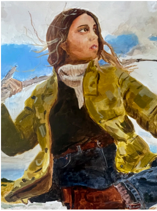
Artemis acrylic on canvas 60x74.5cm