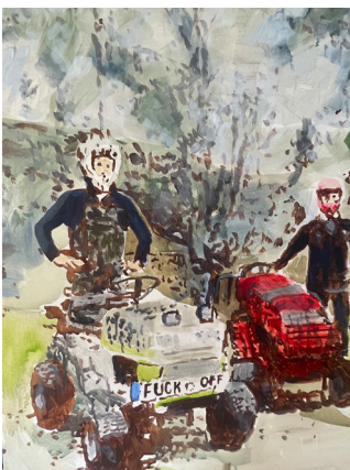
Lawn Mower racing Southern Tasmania acrylic on canvas 61x81cm

In rural settings cars take on an important role, they are a working vehicle and a refuge from danger and social spaces. They are topics of conversation, express identity and become lifelike. Painted with a hint of the 'traditional landscape' painting, the goldne hour light gives a romantic aspect to the scene.